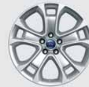
18" x 7.5" alloy wheel

Seat insert: Prada in Charcoal Black Seat bolster: Torino Leather in Charcoal Black Instrument panel: Charcoal Black