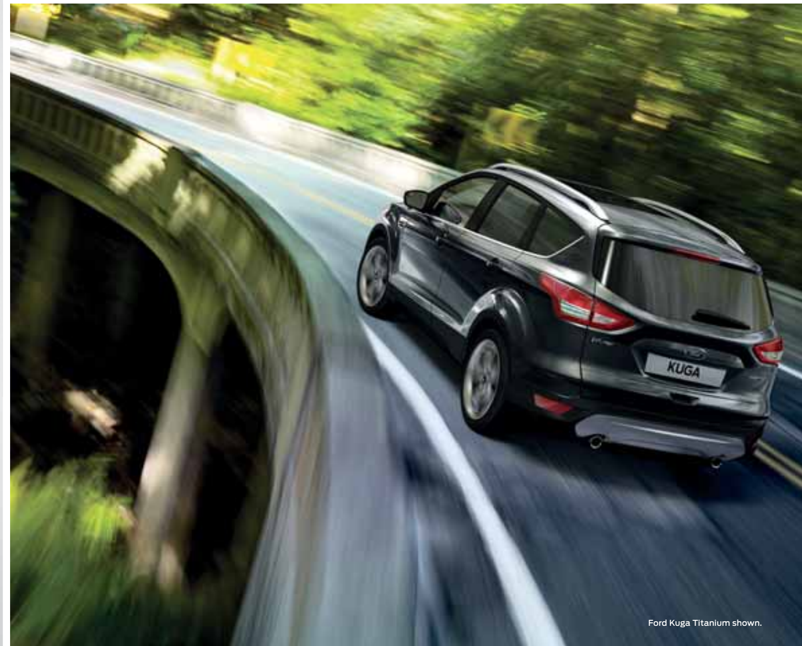
Ford Kuga Titanium shown.

SYNC ™ is there for you when you need it most. If you're in an accident that deploys the airbags or activates the fuel pump shut off, Emergency Assistance uses your paired and in range mobile phone, to dial emergency services and provides them with your precise GPS coordinates.