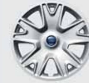
17" x 7.5" steel wheel

Seat insert: Prada in Charcoal Black Seat bolster: Lux in Charcoal Black Instrument panel: Charcoal Black